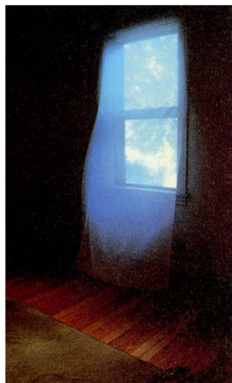
Left: NADINE NORMAN In Passing (detail), 1992, installation with bed of ashes.