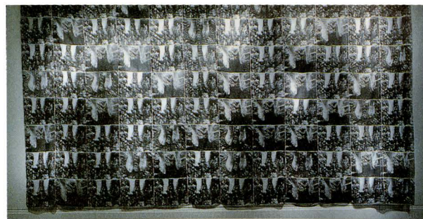
PENELOPE STEWART L'Invisibilité, Un Acquis de longue dat / Being Invisible is well practiced. (installation and detail), 1993, photo silkscreen on silk organza.

In the dining room, Lois Andison installed an over-sized dinner table with two rotating steel bowls recessed into the surface, one holding toy cows, the other pigs. Upstairs in the master bedroom, Christine Ho Ping Kong nailed a series of miniature model homes to