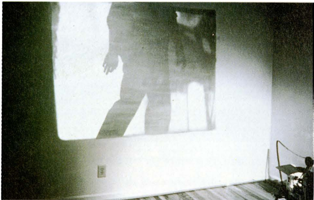
NADINE NORMAN In Passing 1992, installation detail, 16mm b.& w. film loop and viewer's shadow.

rubber and filled with water, barely held its own placed in the corner next to Corneil Van der Spek's enormous canvases of buffed body builders.